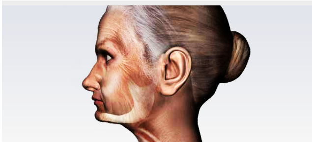
Figure 1: In the event of tooth loss, the body breaks down the jaw bone.