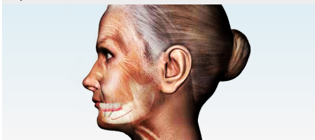
Figure 2: Implant restoration preserves the jaw bone.

Beautiful, well-fitting teeth not only make smiling easier, they also give you confidence. They symbolise health, vitality and joy of life.