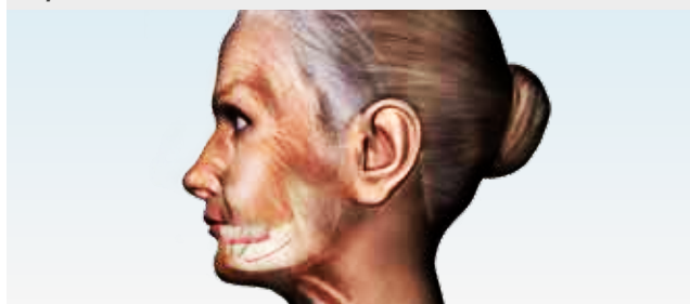
Figure 2: Implant restoration preserves the jaw bone.

Beautiful, well-fitting teeth not only make smiling easier, they also give you confidence. They symbolise health, vitality and joy of life.